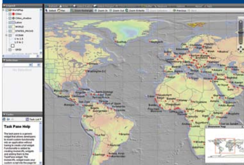
Flexible Layout Template design showing a map with capital cities, created using raster digital elevation map and vector data from SDF and Oracle.

Flexible Web Layout Templates and application widgets accelerate the development of web mapping applications created with Autodesk MapGuide Enterprise. Since design and development tasks are separated, both nonspatial web designers and application developers can quickly build rich web mapping sites. With access to a growing number of widgets and web templates, designers can focus on site aesthetics without writing much code. And developers can freely focus on building powerful interactive AJAX (asynchronous JavaScript® and XML) applications.